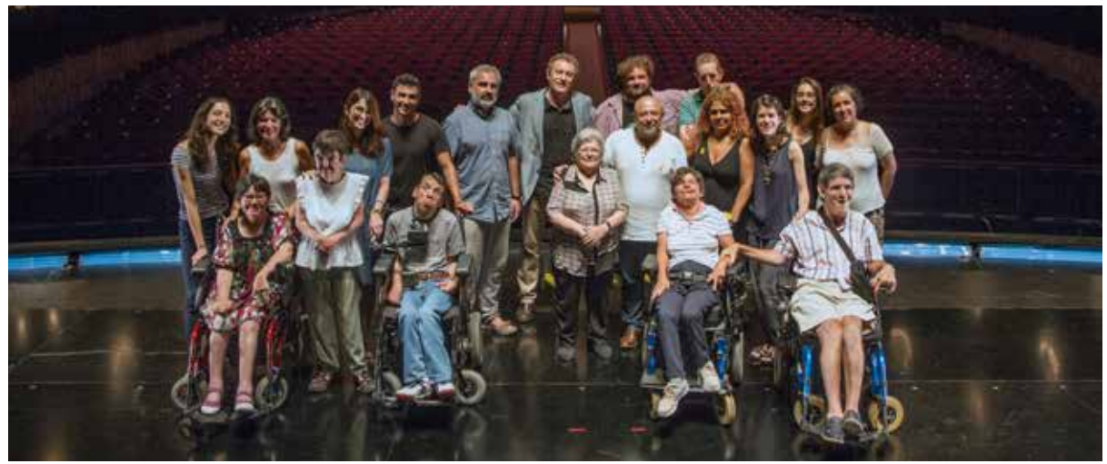
Apropa Cultura is made possible by all of us: institutions, cultural facilities, patrons, professionals in the social and education fields, users of community organisations and the team involved in the programme. Photo taken when filming the video for the 2018 Cultura Apropa Week, an image that acknowledges the importance of all the people involved in the project.